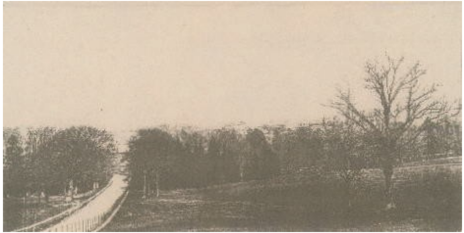
The Old Drive c1870.

It was with the ownership of Abel Lewes Gower, that money began to be spent on the estate once more. Within a few years of inheriting Castle Malgwyn, Abel Lewes had brought in Ambrose Poynter to design and build the stables that are still standing on the river's edge, linking them to a new lodge and gates with a new drive that ran along the embankment separating the Teifi and the now disused 'canal'. The old drive had run along the route of the old high road some fifty yards further up the hill.