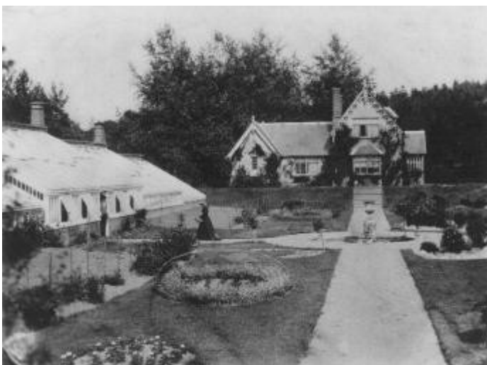
Castle Malgwyn Gardens c1875.